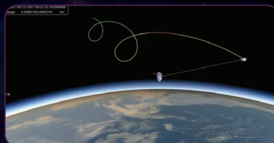
Close proximity of chaser flyby with target spacecraft