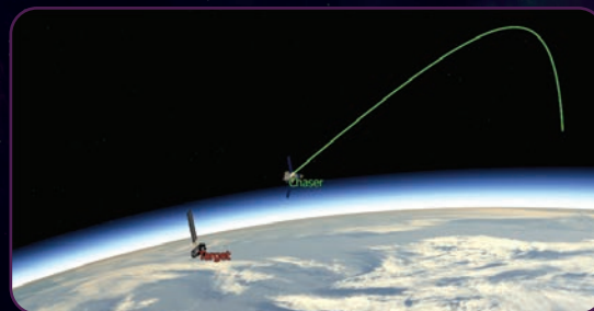
Rendezvous approach of chaser Spacecraft to Target Satellite

a.i. solutions' ObsSIM service is available for purchase as a subscription. Each subscription allows a user to schedule an unlimited number of simulated scenarios for testing, training, and exercise purposes, and on-orbit events can be created at any time during the subscription period. Users with an active subscription that desire to deploy additional instances of ObsSIM in a closed network can do so for an additional annual fee.