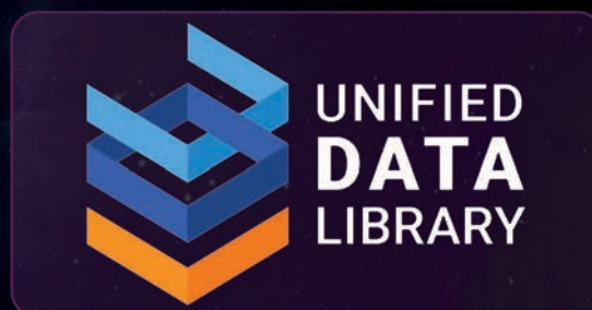
Available today on the UDL