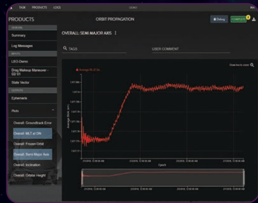
Meridian orbit propagation

The web application is the interface layer for Meridian and provides access via a web browser or a REST API. User-based permissions and roles can be used to configure authenticated levels of control throughout Meridian. System activity is logged and can be sorted/filtered to review runs and troubleshoot any issues. Operator inputs are stored internally and tied to the resulting products, making it easy to rerun tasks. The REST API machine interface allows Meridian to perform automated processes, ingest telemetry and tracking data, generate products on demand, and share those products with other ground system components.