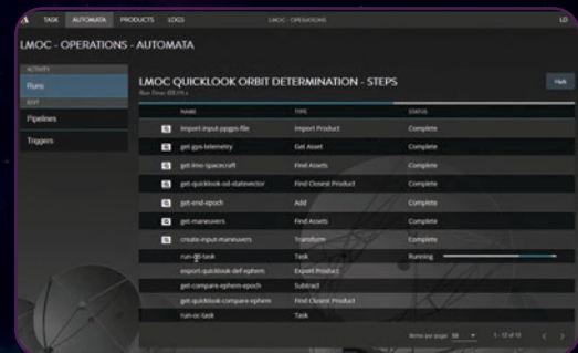
Enables manual and automated product generation